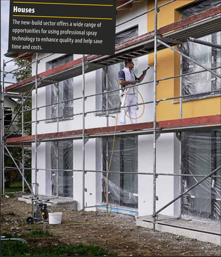
Houses The new-build sector offers a wide range of opportunities for using professional spray technology to enhance quality and help save time and costs.