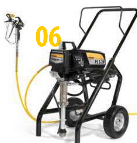
06 - ProSpray 3.29 - Solid airless unit for emulsion jobs up to 800 m²