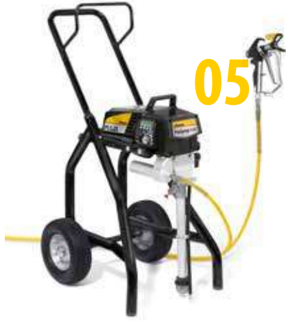
05 - ProSpray 3.25 cart-mounted - Compact emulsion unit, ideal for medium sized objects