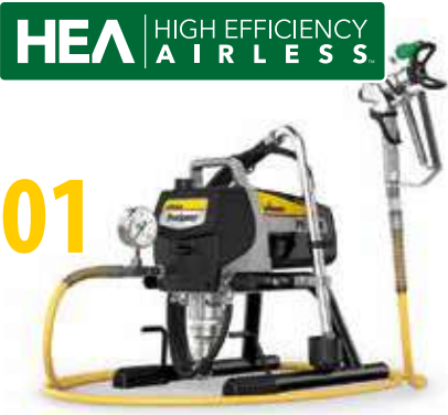
01 - ProSpray 3.20 HEA Emulsion - The compatible piston pump for Airless beginners

The machines for interior refurbishments and facade renovations are designed for small and medium-sized projects. They range from easy to use entry-level units through to professional solutions.