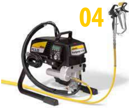
04 - ProSpray 3.25 skid-mounted - Compact emulsion unit, ideal for medium sized objects