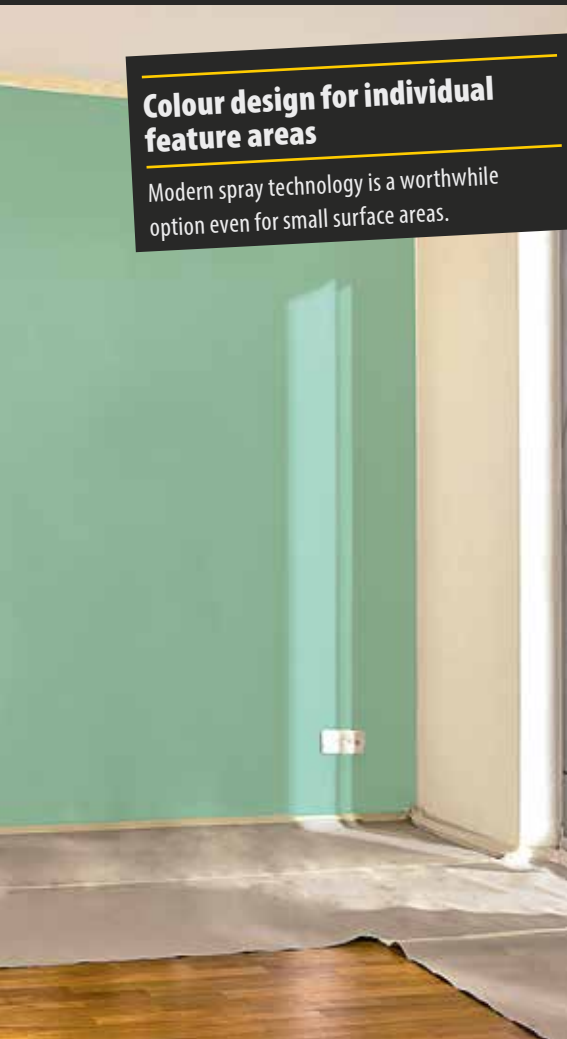
Colour design for individual feature areas Modern spray technology is a worthwhile option even for small surface areas.