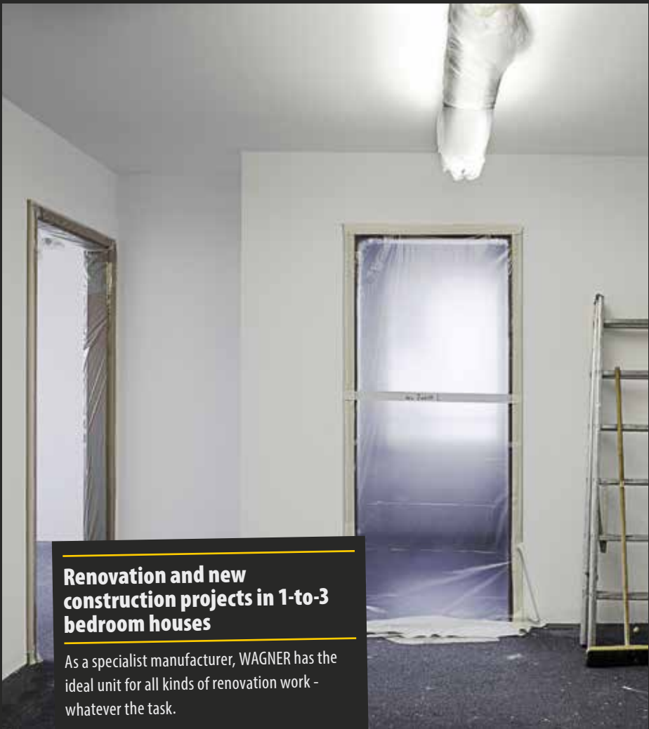
Renovation and new construction projects in 1-to-3 bedroom houses As a specialist manufacturer, WAGNER has the ideal unit for all kinds of renovation work - whatever the task.