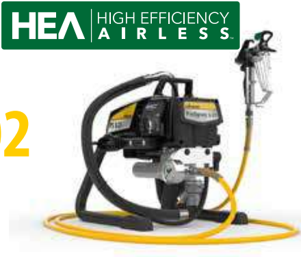
02 - ProSpray 3.21 HEA Emulsion - Small and compact - for object sizes up to 200 m²

Innovative, low-pressure airless technology: up to 55% less overspray