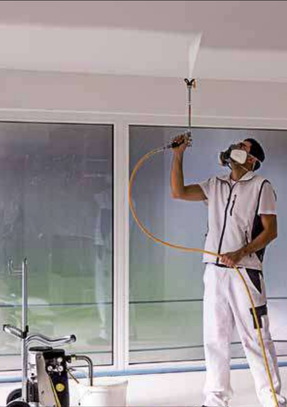
Interior wall coating using emulsion and latex paints A quick and perfectly even finish for interior walls and ceilings - professionally and without fatigue.