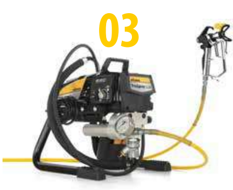
03 - ProSpray 3.23 - The small surface specialist for emulsion jobs

Flexible suction hose for material processing directly from the original container