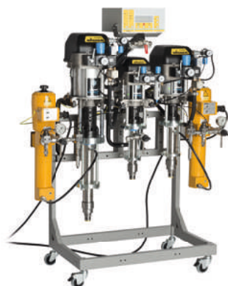
TwinControl 35-70 with material heaters for AirCoat applications