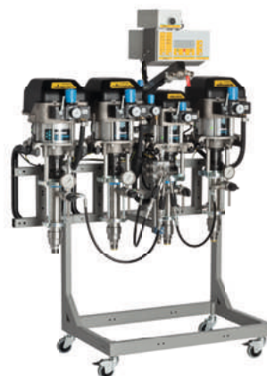
TwinControl 35-70 with extension for a second color