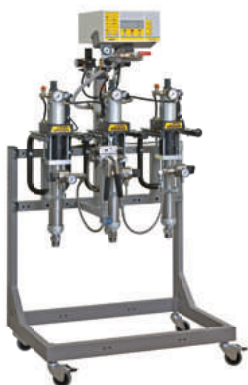
TwinControl 5-60 for airspray applications

The TwinControl can be configured for your individual application purpose.