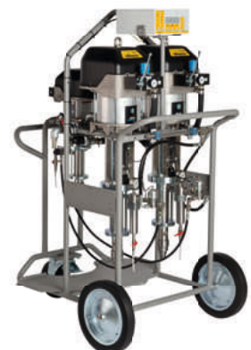
TwinControl 72-200 for heavy corrosion protection, mounted on a trolley